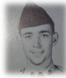
Suspect No. 4