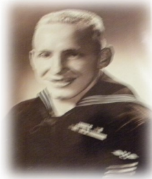
Suspect No. 1

The below pictures are of just some of the military veterans that are/were members of our lodge. Can you name them? We sometimes forget that they have served our country in times of peace and war with honor.