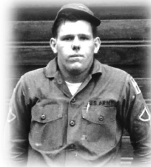
Suspect No. 6