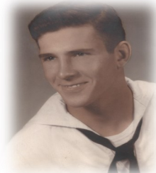
Suspect No. 7