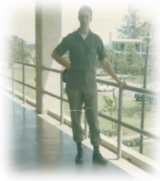
Suspect No. 3