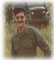
Suspect No. 5