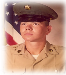
Suspect No. 2